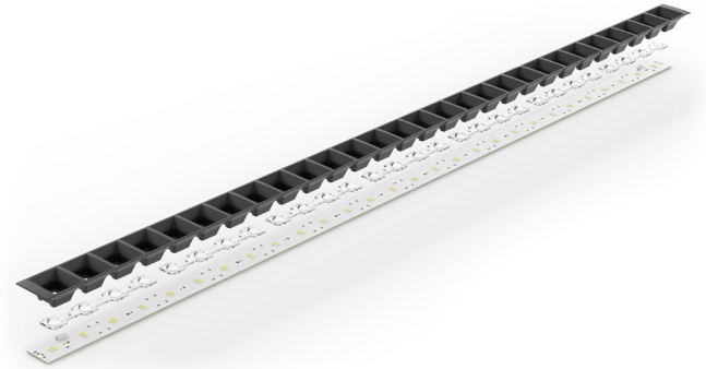
The image shows version 2C. The number of connectors may vary depending on the type of module.