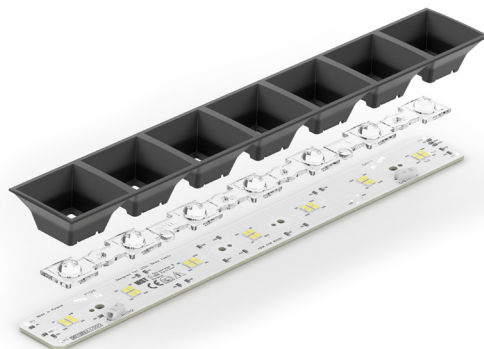
The image shows version 2C. The number of connectors may vary depending on the type of module.