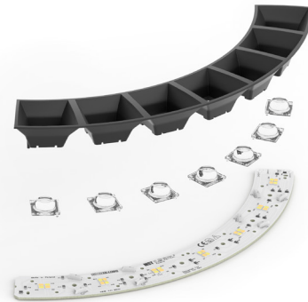
The number of connectors may vary depending on the type of module.